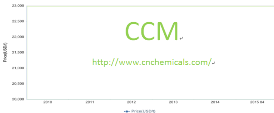
Figure 2.2.3-1 Annual market price of sodium borohydride ( \geq 98\% ) in China, 2010 - April 2015

Note: The price is calculated based on the quotations from the top four producers in each period.