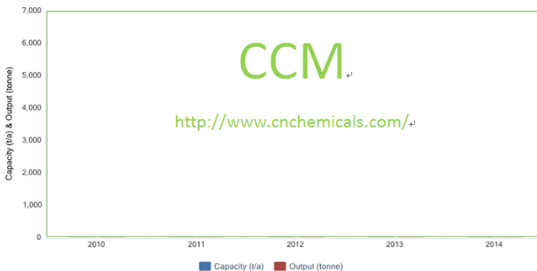
Figure 2.1-3 Capacity and output of sodium borohydride in China, 2010-2014